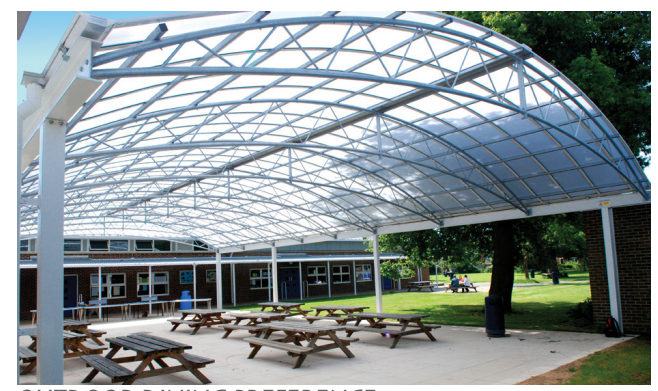
OUTDOOR DINING PREFERENCE

Outdoor Spaces In addition to the Student Quad, the participants were interested in the potential that improved landscaping would improve the "curb appeal" of Orange High School. Athletic facilities, and their renovation, is also an opportunity to provide highly visible, community oriented improvements to OHS.