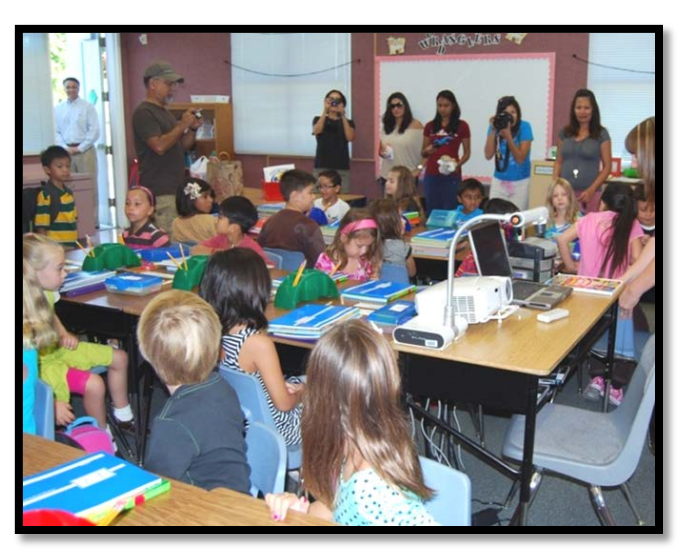
Chapman Hills parents show their support!