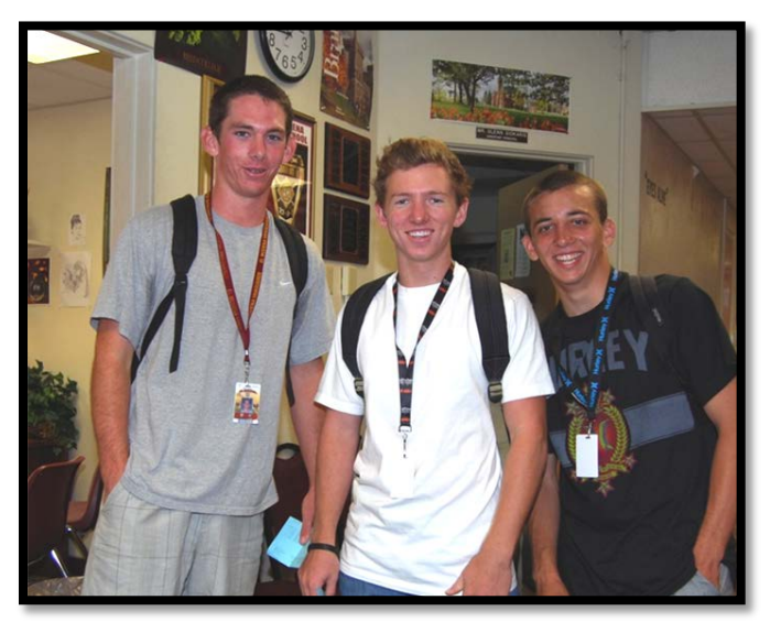
El Modena students wear their student IDs with style!