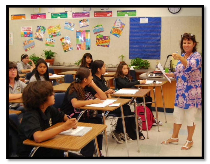
Teaching and learning at Yorba!